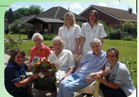
Ladies at Southernwood House on National Carers week

Fresh strawberries are being enjoyed and eaten by residents .